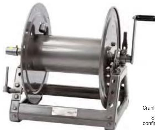
Crank rewind Standard configuration shown